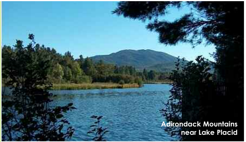
Adirondack Mountains near Lake Placid

www.ogdensburg.org www.visit1000islands.com www.ogdensburgny.com www.lakeplacid.com northcountryguide.com www.adirondacks.org www.ogdensburgk12.org