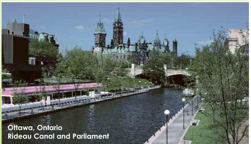
Ottawa, Ontario Rideau Canal and Parliament